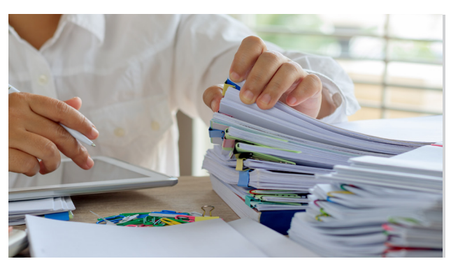
Paper applications that are sent directly to Terra Quest from the local authority