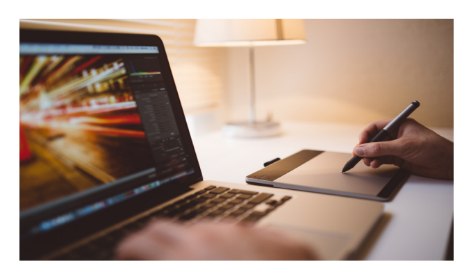
Online applications submitted using the Planning Portal