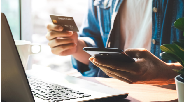
Process all payments through the Planning Portal payment service