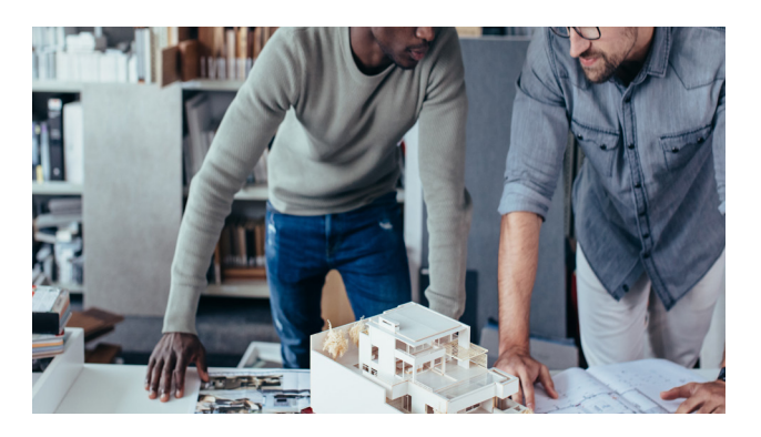
All application types house holders minors/majors and others