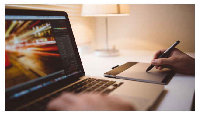
Online applications submitted using the Planning Portal.