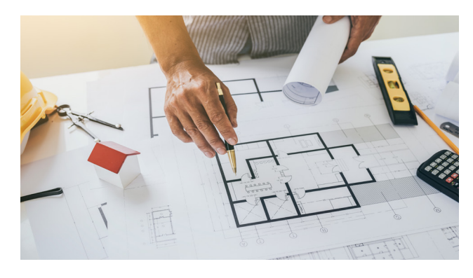
Applications evaluated based on local policy and national framework.