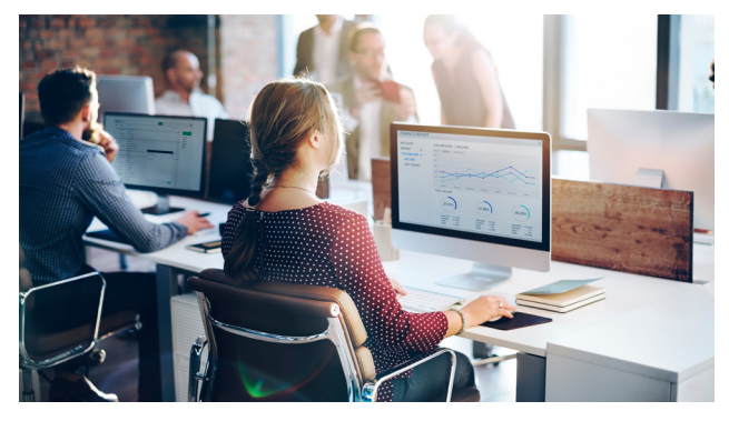
Applications managed working with agents and applicants.