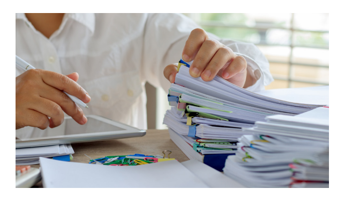
Pre-application advice, screening and submission support provided.